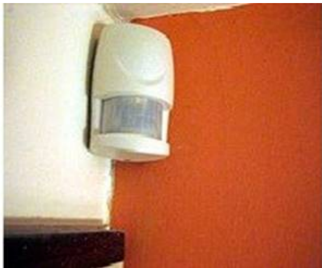
C:\Users\MCS\Desktop\1.jpg Passive Infrared Sensor

These types of sensors are designed for indoor use. Outdoor use would not be advised due to false alarm vulnerability and weather durability. Passive infrared detectors