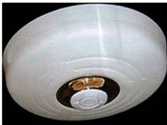
C:\Users\MCS\Desktop\1.jpg Heat Detection System

Smoke, heat, and carbon monoxide detectors